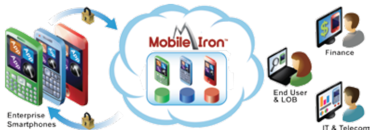
MobileIron Virtual Smartphone Platform

THE APPROACH: Phones have become computers and require a fundamentally new, data-driven approach to security, cost, and quality management. MobileIron's patent-pending smartphone data virtualization technology creates a central view of smartphone content, activity, and applications in the data center to give IT and end-users real-time intelligence and control across the enterprise.